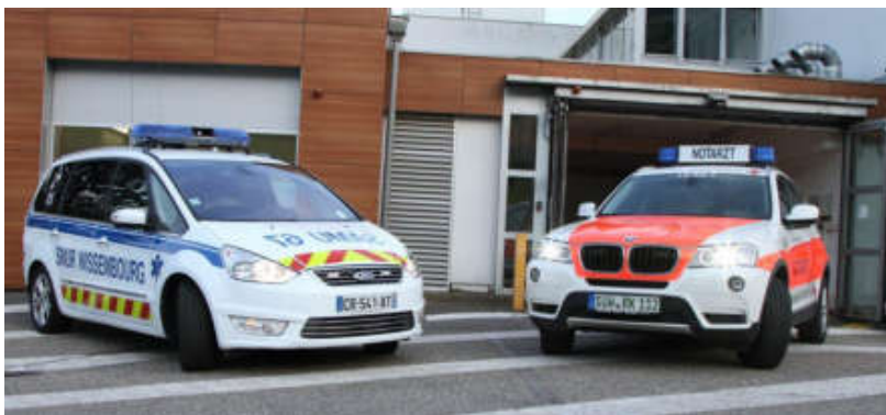
French and German emergency medical services vehicles

* The CESER calls for the cooperation that took place between hospitals near the Franco-German or Franco-Luxembourg borders during the peak of the public health crisis to be made permanent ( The CESER Grand Est's 100 proposals "for an economic, social and environmental refoundation" - 2021 - Proposal no. 71 ).