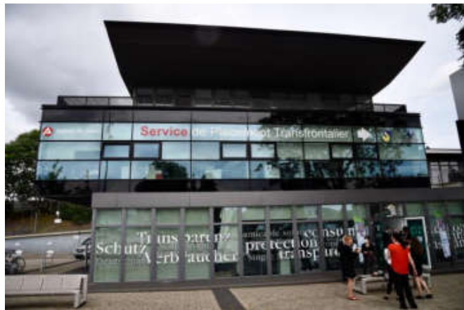
The cross-border job centre building in Kehl

Although digitalisation offers new ways of accessing public services for a majority of users, there is also a risk of a decline in access to rights and of many citizens being left behind because they have difficulties using digital tools. This risk is even greater for the inhabitants of cross-border areas, who have to deal with specific tax and social security regimes.