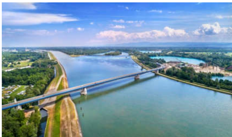
Pierre Pflimlin bridge between France and Germany

Strictly speaking, the notion of public service is absent from German legal terminology. And yet, there are of course activities in Germany that meet the objectives of general interest. These are referred to under the term "Daseinsvorsorge", which first appeared in 1930s. There is no direct translation for this notion in French, but it covers everything that is necessary to the meet the needs of an individual's existence and, often, by extension all that is needed to live a decent modern life in society. The idea of changing needs is therefore present from the outset in this concept, which would be developed with the "Social State" enshrined in the new German constitution of 1949.