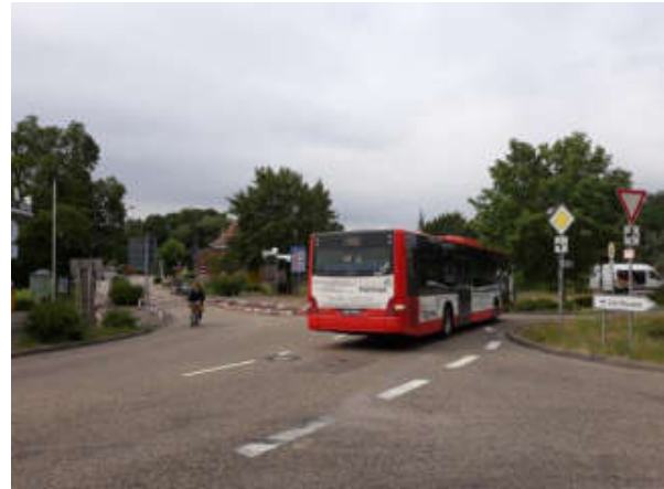
Cross-border bus on the Kandel-Lauterbourg-Berg route

* The CESER calls on the Grand Est Region to bring all its weight to bear move forward the plan to re-open the railway line between Colmar and Freiburg , and to speed up the reactivation of the Rastatt-Haguenau line , which is actually an obligation under the Aachen Treaty. These two projects must be added to the European Commission's trans-European transport network (TEN-T) map, like the Givet-Dinant line.