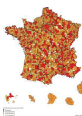
The INSEE living areas

Classified in six main categories (services to individuals, shops, education, healthcare, sport-recreation-culture, transport), these amenities and services are divided into three ranges: local amenities, which are present in a large number of municipalities (e.g.: post office, pharmacy, etc.), those of the "intermediate range" (supermarket, junior high school, etc.) and those of the "higher range" (senior high school, hospital, railway station, etc.).