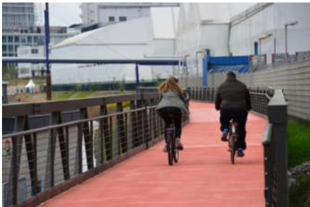
Basel-Huningue-Weil am Rhein Trinational Greenway

According to the Federal Council in 2004, public service should be understood as "an offer of quality basic services, consisting of infrastructure, goods and services, accessible to all categories of the population and offered in all the regions of the country at affordable prices and subject to the same conditions" .