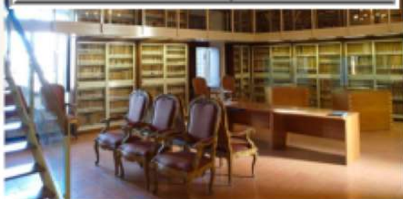
BIBLIOTECA DIOCESANA BEATA LUCIA BROCCADELLI, NARNI