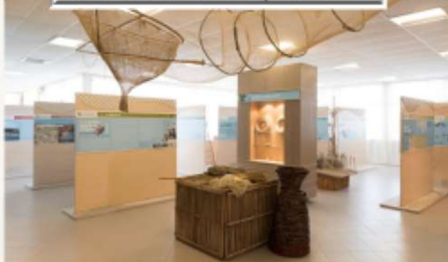
MUSEO DELLA PESCA, MAGIONE