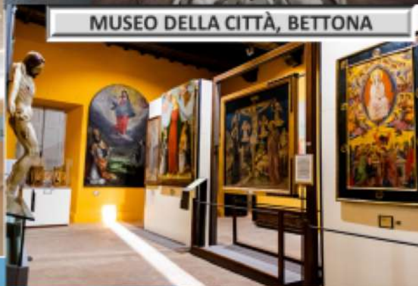
MUSEO DELLA CITTÀ, BETTONA