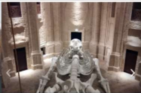
EX CHIESA SS ANNUNZIATA, FOLIGNO