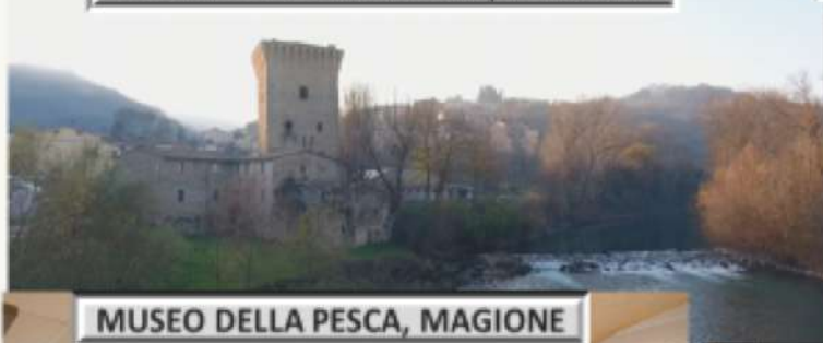
ECOMUSEO DEL TEVERE, PERUGIA