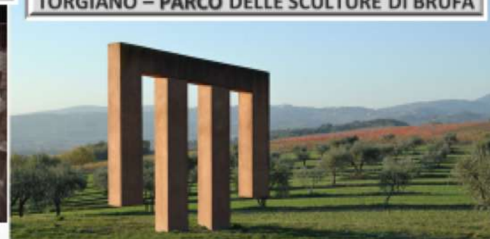
TORGIANO – PARCO DELLE SCULTURE DI BRUFA