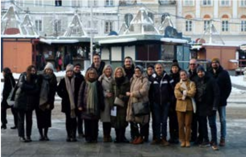
(Study Visit – Linz and Vienna)