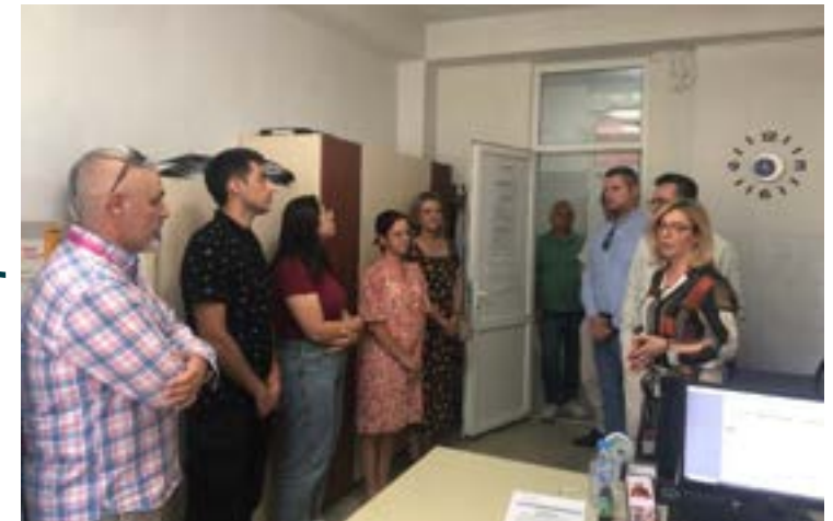
(Innovative Elderly Care in Delchevo)