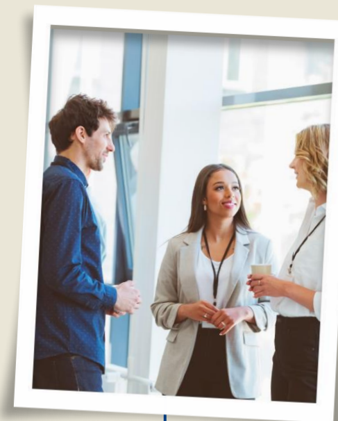
EURegionsWeek Close to You